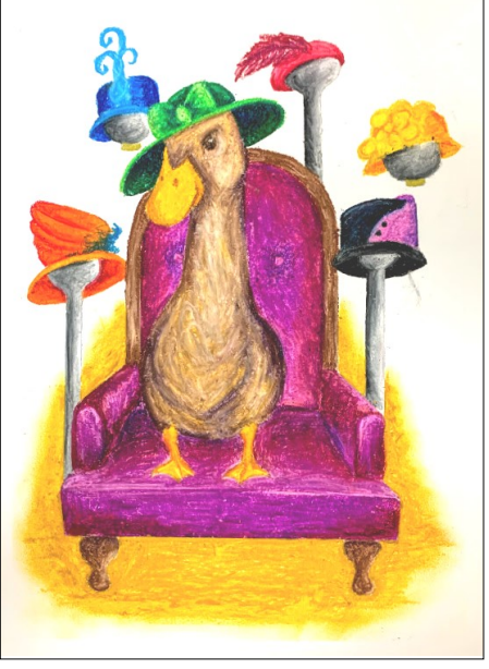
Artwork Example: I Like to Wear Her Hats

*Please note that this is just an example of the lesson. Students should always be encouraged to create and complete their own artwork.